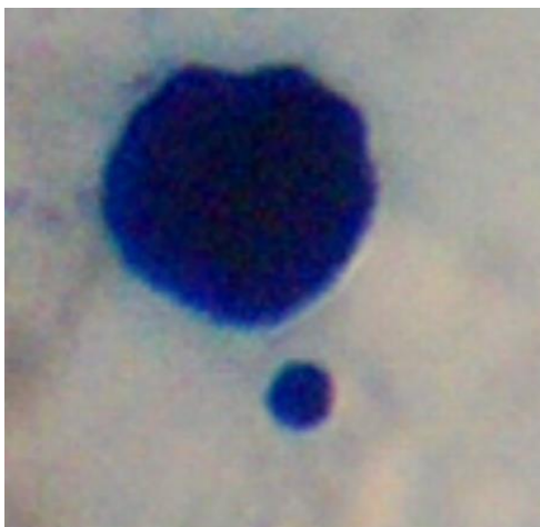
Fig.(1 -3 ) micronuclei (1000X ).