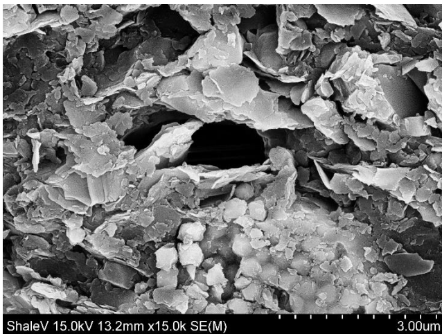
Figure 2. Typical of microstructure of sedimentary rock (shale)

features, intra-granular porosity, anisotropy degree, petrophysical characteristic, mineralogy, thermal history, organic content, location, depth, and so on. of the porous rock and shale are needed [1]. In general, there are no unique parameters for shale.