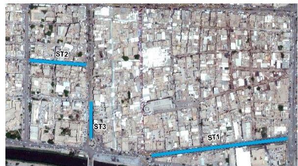
Figure 3. Location on-street parking in the study area

Then a survey was conducted to determine the number of parked vehicles in all of the streets of Al-city Diwaniyah's centre in the study area, as well as the number of parked vehicles in 22 parking spaces located in the city centre of Al-Diwaniyah. Fig 4 show the location of on street and off street parking lots in the study area.