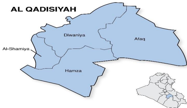
Figure 1. A map of Iraq showing the location of the city of Diwaniyah

It is crucial to get parking information from urban streets in order to research the effects of on-street parking. Al-Orzady Street, Al Saray Street, and Almuswreen Street are the first three locations that have been chosen for this project to study its characteristics in the evening period. In Al-Diwaniyah city, these locations are among the busiest ones on-street parking. Fig 2 show the border of study area.