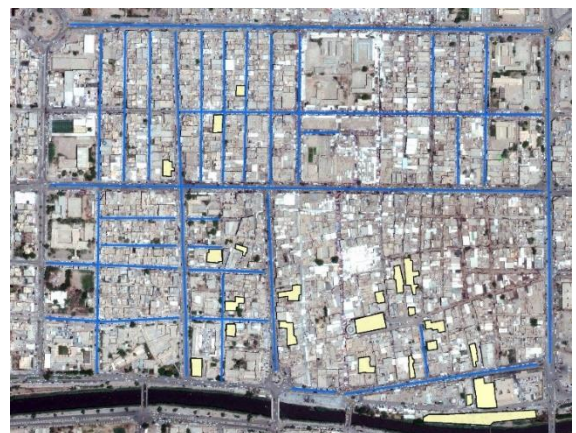
Figure 4. Screen shot for all roads and parks in the study area