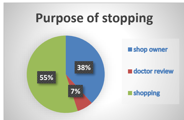
Figure 6. The percentage of purpose of stopping

What was discovered from the questionnaire survey that took place in ST1, ST2, and ST3 to determine the reason for parking the vehicle on the street, as show in the Fig 6.