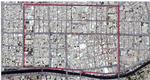
Figure 2. Screenshot for the study area

The number of all vehicles parked on and off streets in the study area was calculated at the morning and evening at different days, and the parking sites on the street were chosen using the GIS application, which was also used to estimate the length of the street allowed for stopping. The attributes were ascertained using the in-out survey method. To find out why the car was parked on the street, a questionnaire was also created.