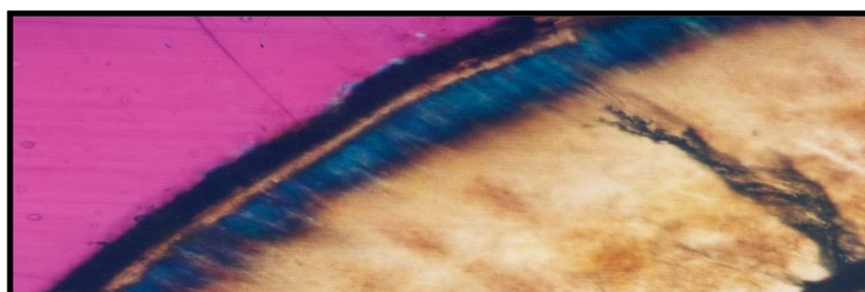
Fig. (1):- Lesion depth in A1 sample.

Continuous wave carbon dioxide laser irradiation results in a significant increase in caries resistance of deciduous enamel. This enhancement of deciduous enamel reaches as high as 82%.