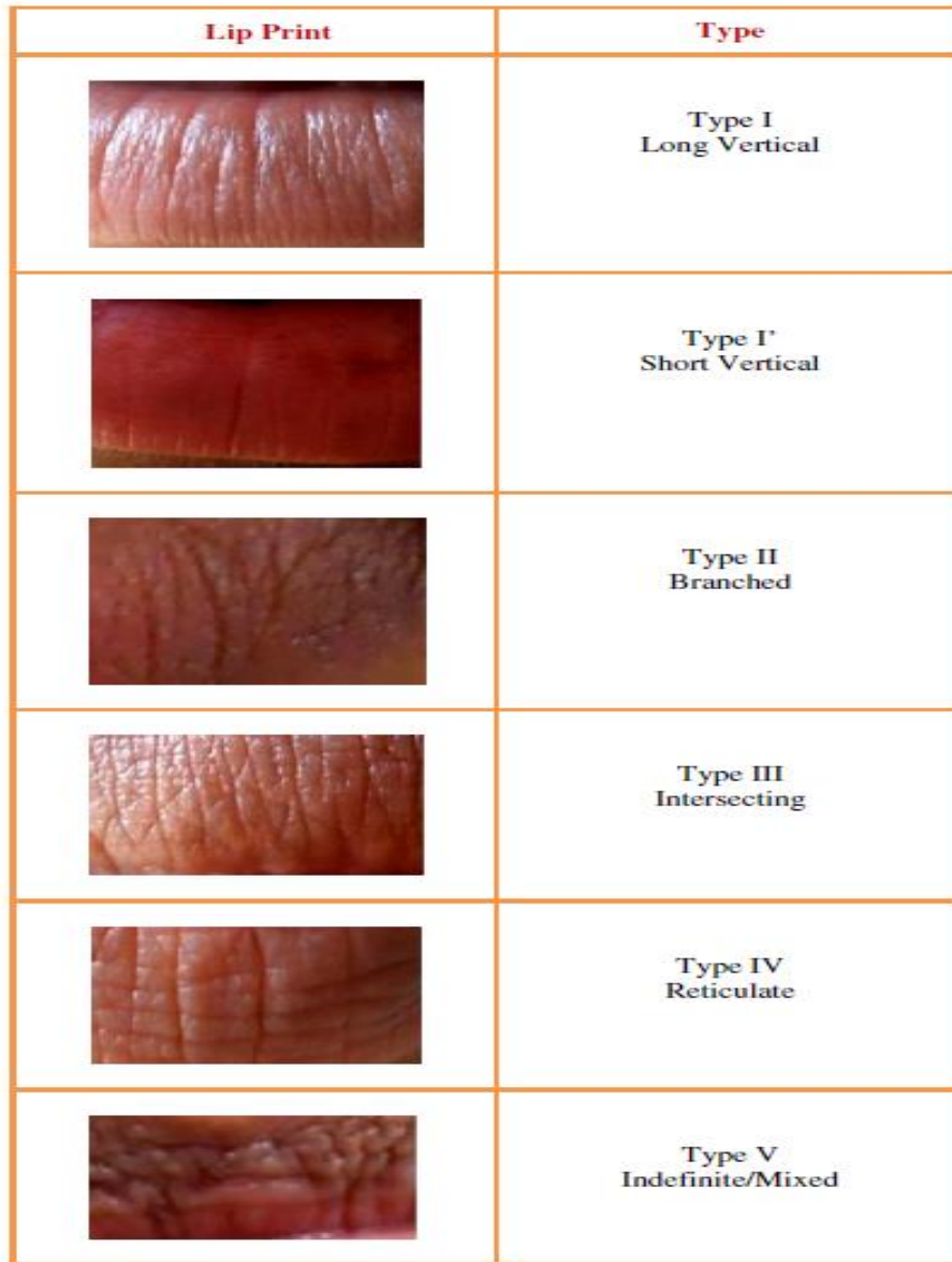
Fig. (3): Photographs showing all the patterns of the lip prints.