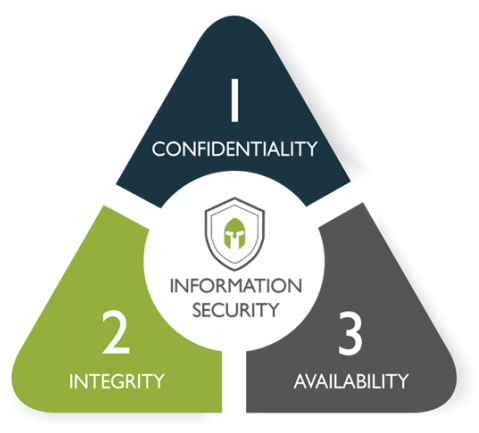
Fig 1. The CIA triad [11].

every now and again involves compromises that could influence execution and speed. While an answer that totally keeps up with classification and respectability could function admirably in certain pieces of the economy, similar to medical care, it probably won't fill in too in different areas, similar to online business [10]. Table (1), Figure (2) and the following passages likewise give portrayals of the different parts of network safety.