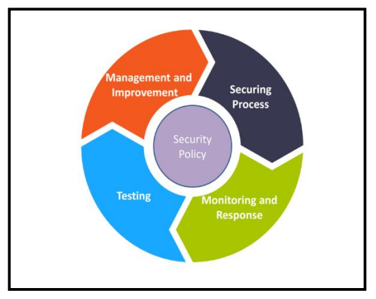
Fig 2. Cybersecurity components [9].