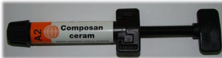
Fig. (7) A2 composan ceram.