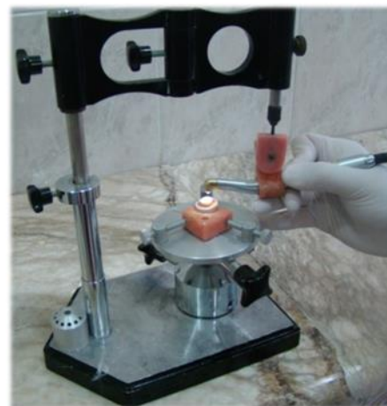
Fig. (4): Modified surveyor with acrylic holder that hung the laser hand piece