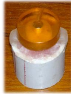
Fig. (6): Rubber mold was fixed over the sample