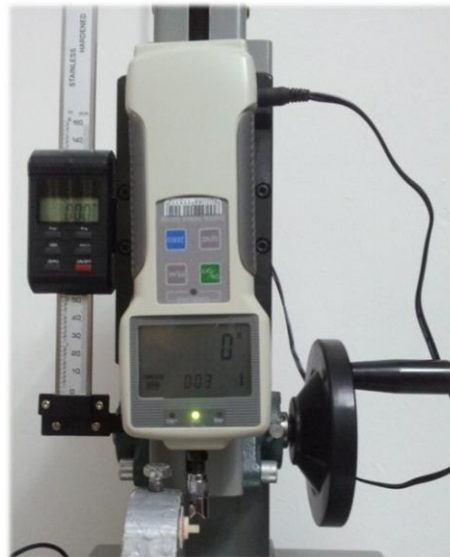
Fig. (8) Digital force gauge.