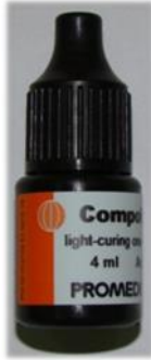
Fig. (5): Light curing compobund1 bonding agent.