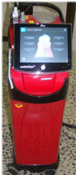
Fig. (3): Er,Cr:YSGG laser