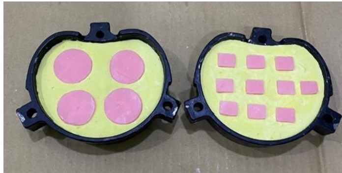
Fig. (1): Modelling wax investment in different sizes in the lower halves of the flasks to make a specific mold for hardness and roughness tests.

smoothness of the resilient liner was not significantly affected when immersed in the Protefix cleaning tablet, while the increase in surface roughness of the acrylic soft liner was significant when immersed in a solution of 2% sodium hypochlorite.