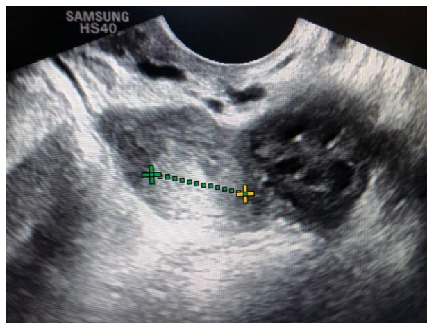
Figure (2): illustrates the findings from transvaginal ultrasonic, revealing an ectopic pregnancy mass located in the adnexal region. There is no apparent gestational sac echo.

On the contrary, transvaginal ultrasound proved to be more precise in diagnosing the presence of a pregnancy sac and yolk membrane, besides determining the location and dimensions of the gestational sac. It also provided a clear visualization of the embryo, detected the original fetal heartbeat, and measured both the endometrial thickness and deepness of pelvic fluid, (seen in figure 2).