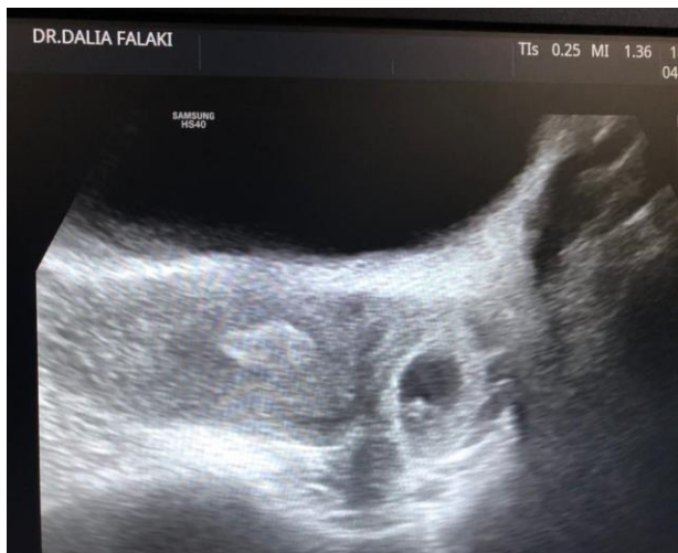
Figure (1): displays the outcomes of a transabdominal ultrasonic, showing an ectopic pregnancy mass with increased echo in the adnexal region.

Furthermore, the images did not provide clarity regarding the presence of a Vitelline Sac, the presence of an original cardiac beat, the measurement of endometrial thickness, the presence of pelvic fluid, the assessment of blood flow to the mass, or the existence of ascites (as shown in Figure 1).