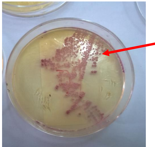
Figure-1: Staphylococcus aureus (mauve colonies) on Chrmoagar™

Our results are based on a total of 100 cases with AD (the clinical diagnosis of AD patients is confirmed by dermatologists and specific AD criteria. Table (1) showed that from the total of AD patients investigated, S. aureus positive cases was correlated with 54 cases (54%), and 10 cases (20%) from the total control group, with significant statistical differences (P< 0.05). All isolates were investigated and the detection was confirmed as S. aureus, Gram positive cocci, with mannitol fermentation, Catalase and Coagulase positive.