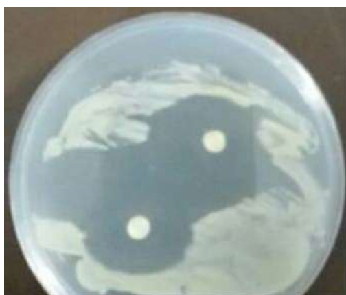
Figure 2: The effect of different concentrations of partially purified of Bacteriocin (1000mg/ml) of Pediococcus pentosaceus on the diameter of inhibition zone against S.aureus measured by wells assay method.

Also, the effects of different concentrations of this Bacteriocin also studied and shown in Figure 3. It shows the higher diameter of inhibition one (45 mm in diameter) at Bacteriocin of (1000 mg/ml) concentration, then the diameter will be decrease at (500, 250 mg/ml), while the same diameter (20-30 mm) of inhibition zone at both two (250 & 125 mg/ml) of Bacteriocin concentration.