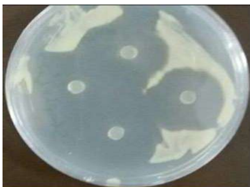
Figure 1: The effect of different concentrations of partially purified of Bacteriocin (1000mg/ml) of Pediococcus pentosaceus on the diameter of inhibition zone against S.aureus measured by agar plug assay method.