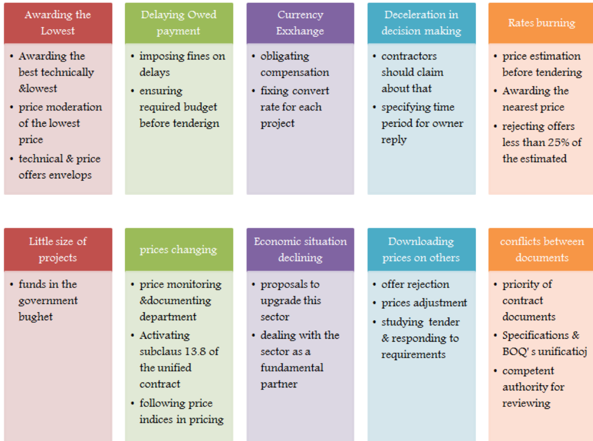
Figure (3): Main construction contracting sector problems and their proposed solutions framework [11]