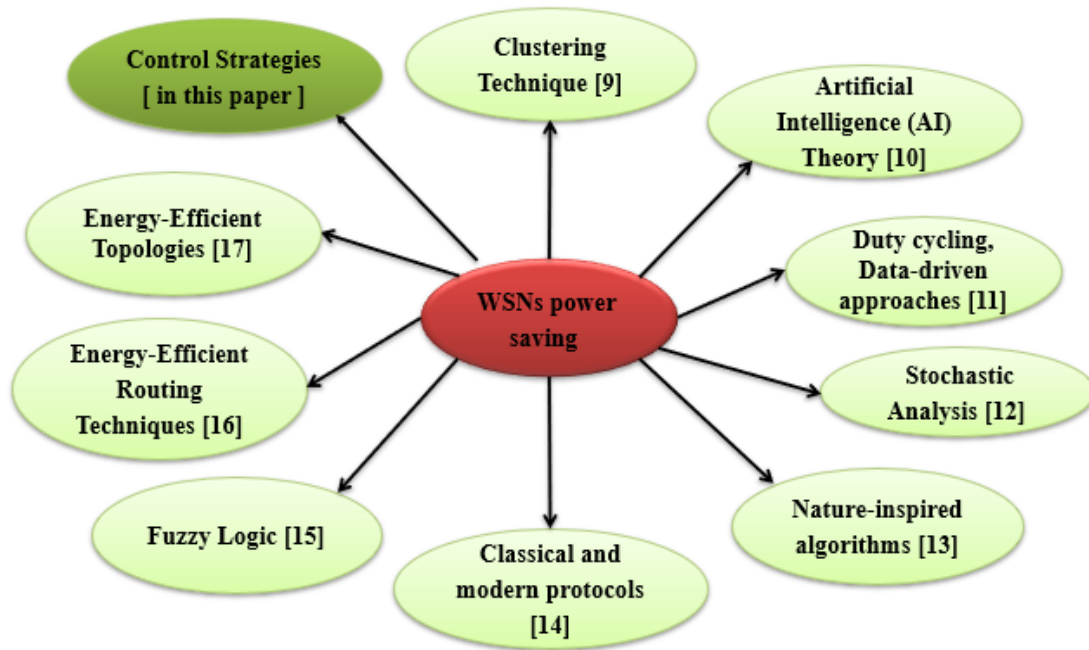
FIG. 3. WSNs POWER MINIMIZATION TECHNIQUES.

DOI: https://doi.org/10.33103/uot.ijccce.22.4.4