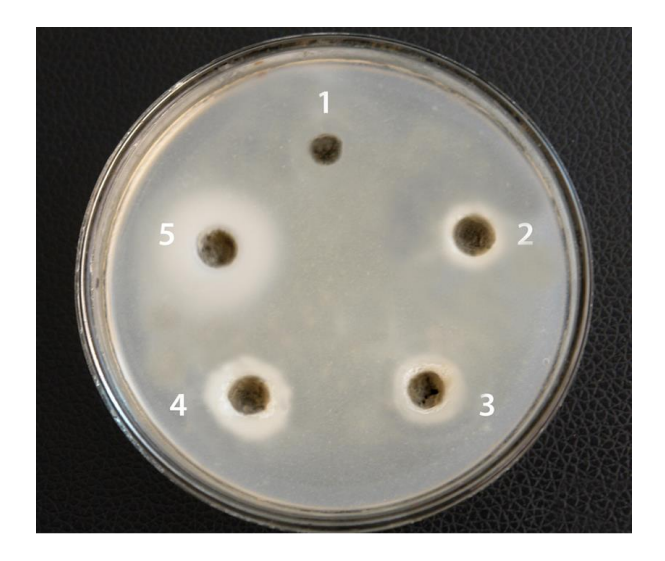
Figure 1: The scoring of proteinase enzyme produced by yeasts on bovine serum albumin medium

Phospholipase enzyme was produced from 8 isolates of C. albicans (34.8%) out of 18. Concerning enzymatic scoring, 3 isolates with (++), and only 5 with (+). The others Candida species did not produce the enzyme Table 3.