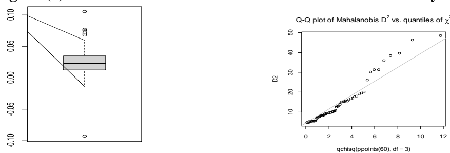
Figure (2) Mahalanobis distance for the data of the banks under study.

In Figures 1 and 2, the standard residuals are plotted to identify the outliers, and the outliers identified by Mahalanobis distance appear to be the same as observed for the leverage values. Maximum outliers can be detected by squared distances. Figure 2 shows that some observations have a very large effect on the regression line. The boxplot also indicates that there are some outliers in the standard residuals of the model. We conclude that outliers have a significant effect on the SUR model. Therefore, we will apply robust estimation methods to obtain consistent and highly efficient estimates.