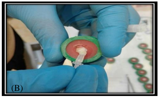
Figure (1) the Surface Treatment (A): Varnish Application. (B): Curodont Repair Application.

Group 4 (SAP<sub>11-4</sub> + FV group): After the demineralization, (SAP<sub>11-4</sub>) were applied firstly as in group 3 after that, fluoride varnish was painted as in group 2. The samples were stored in daily renewed artificial saliva for 4 weeks <sup>(18)</sup>