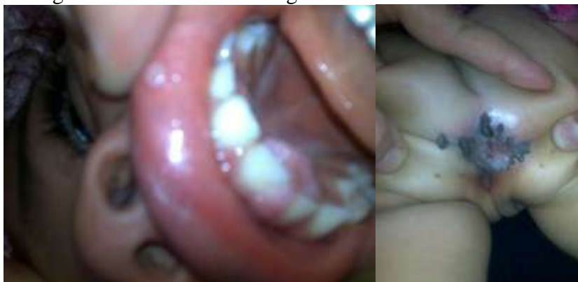
This patient has oral, genital and perianal warts