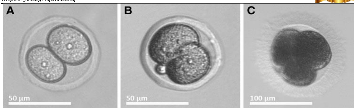
Figure 2. Light micrographs showing the contents of the blastomeres embryos of the lipid droplets, where the images show that the more opacity, the more the cell content of the lipids: (A) Wistar Albino Glaxo rat. (B) mouse. (C) cat (reproduced from [47]).