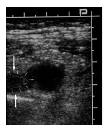
Fig. (4): Sonographic appearance of perforated appendix.