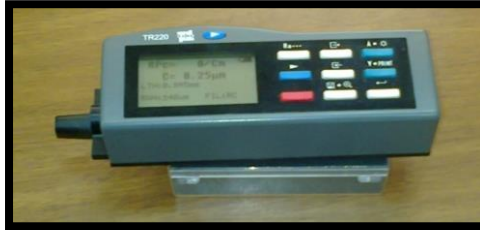
Figure (3): Portable roughness tester.

Portable roughness tester (profilometer device) (Figure 3) was utilized to measure the surface roughness. The analyzer (stylus) of the device was placed over the specimens in contact with sample surface which was moved for a distance 11mm according to apparatus design. The surface roughness values (Ra) in micrometer ( \mu\text{m} ) were collected from screen part of the device. The values obtained in two measurements before and after immersion in each solution [21] .