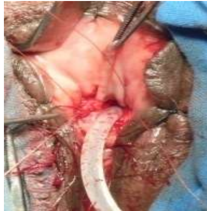
Fig. 3: Operative picture showing dorsal buccal mucosa graft placement.

urethra was performed. The stricture was incised at 12 o'clock position until 1 cm distal to the bladder neck, and the buccal graft was sutured dorsally (Figure-3)