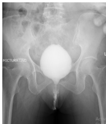
Figure 1 Micturating Cystourethrogram showing stricture urethra

micturating cystourethrogram findings of a narrowed urethra with proximal dilatation are diagnostic criteria (Figure-1).