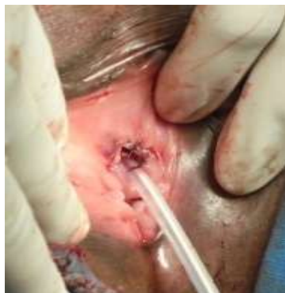
Fig 4: Final post operative appearance after suturing,urethra back to its normal position

with 4-0 vicryl interrupted sutures. After that, a BMG graft is used to stitch the urethra's right and left margins, and a 4-0 vicryl suture is used to stitch the urethra back into normal position (Figure 4).