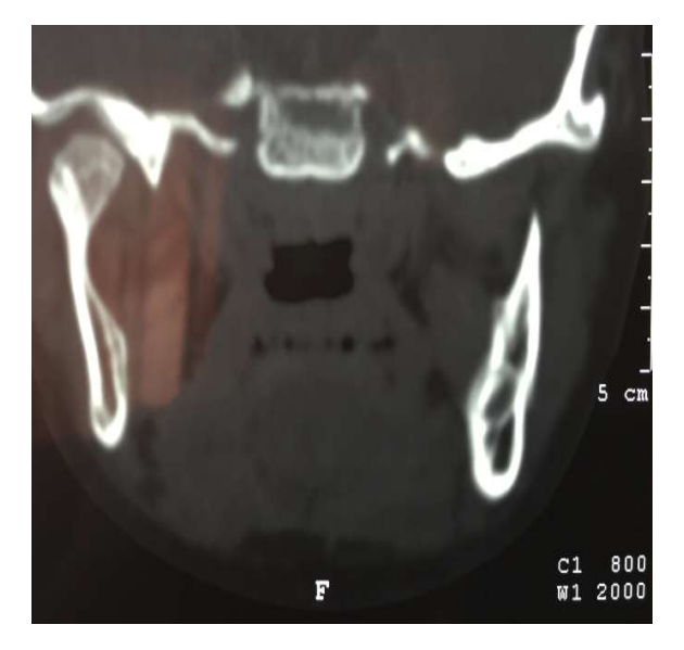
Fig I:CT scan revealed complete restitution remodeling of the condyle

Statistical analysis was performed by using of SPSS (Statistical Package for Social Sciences) version 19. Numbers and percentages were used to describe categorical variables.