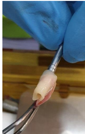
Figure (2): The PRF membrane is gently rolled around the dental implant fixture before installed in its osteotomy bed.