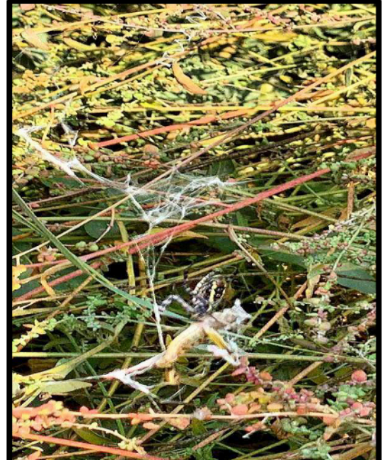
Figure 5b: A. trifasciata The web