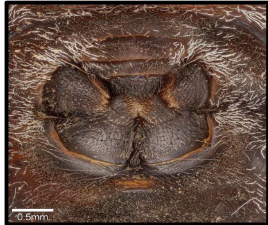
Figure 4: A. trifasciata Spinnerets