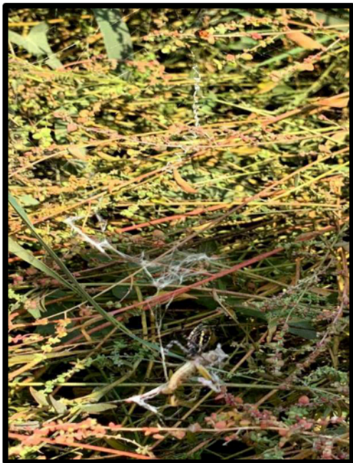
Figure 5a: A. trifasciata The web