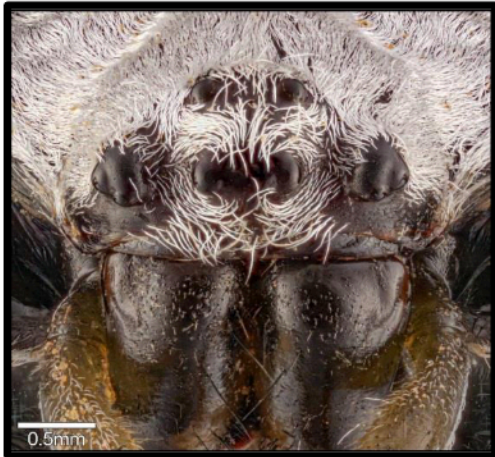
Figure 3: A. trifasciata Eye arrangement