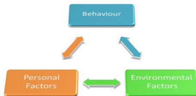
Figure (2) Social Cognitive Theory Factors

This theory was developed by Bandura (1989), It can be a base of social learning theory. It consists of three interchangeable factors (personal, behavior, and environment). This theory states that an “individual can get knowledge by observing others” behavior in a part of the environment”. According to (Bandura, 1989:9), the SCT theory suggests that individual’s mind could be considered as an instrument to guide people towards formulating expectations, abilities and outcomes, etc. The theory is based on two concepts: The first one is Altruism that is, the behavior by which an individual makes an effort to benefit others as argues. While, the second one is self-efficacy , that is, the ability to control the behavior, and people will share their knowledge when they find suitable environment and social networks (Kurnties&Gewirits, 2014:32-34).