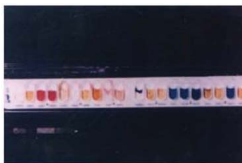
Figure (1) Result of API 20 system of EPEC

The dominance with these percentage is because of E.coli have many virulence factors such as Attachment and Effacing Factor (AEF) and Fimbrial Adherence Factor (FAF) which make these bacteria able to attached to epithelial layer of intestine ,the E.coli also able to produce enterotoxins (Qadri et al. ,2000).