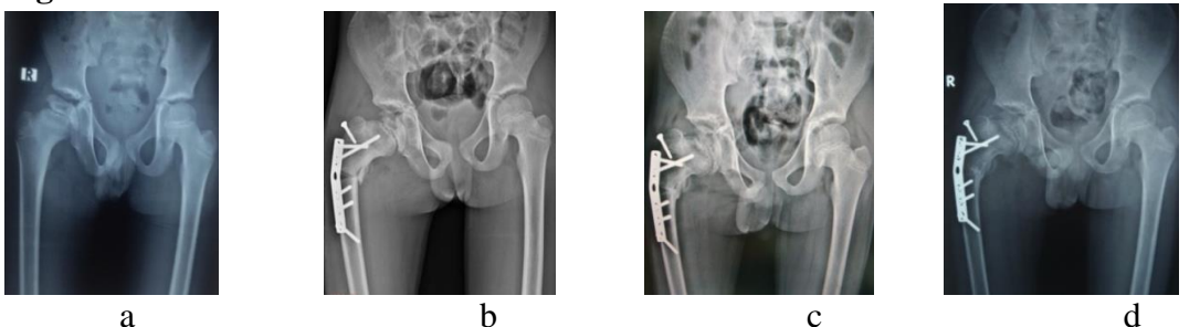
a: Preop. radiograph showing Perthes disease of right hip (Herring's group B). b: Immediate postop. showing proximal femoral varus derotation osteotomy and internal fixation by dynamic compression plate. C: 12 weeks follow-up showing union of osteotomy site. D: 1 year follow-up.