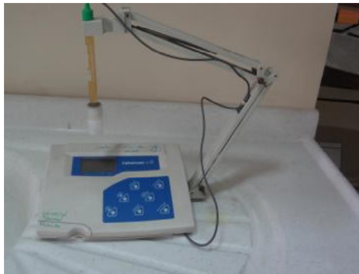
Fig (3):Calibrated digital PH meter used in this study.