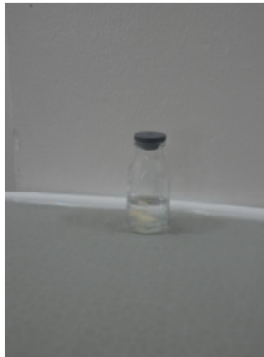
Fig (2): Sample stored in deionized water.