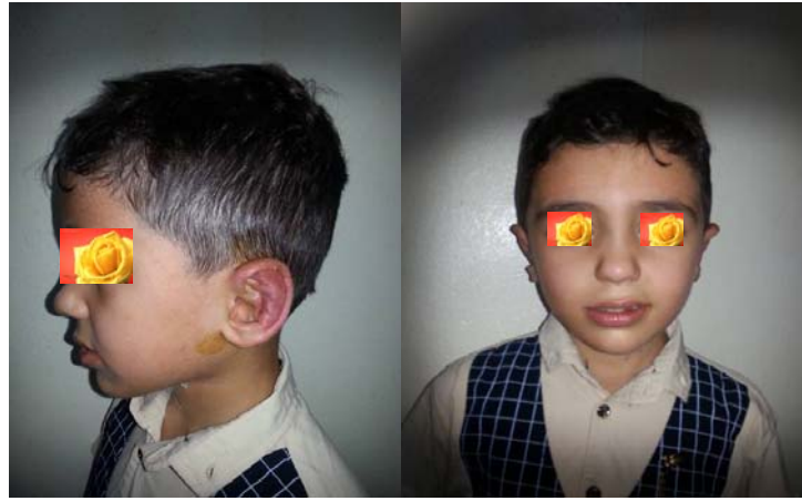
Three days post operatively