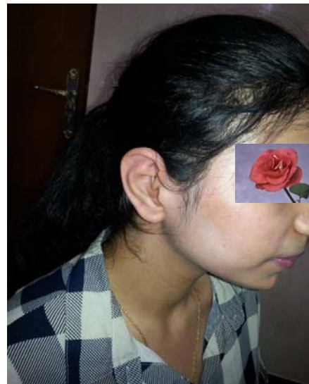
27 days post operatively