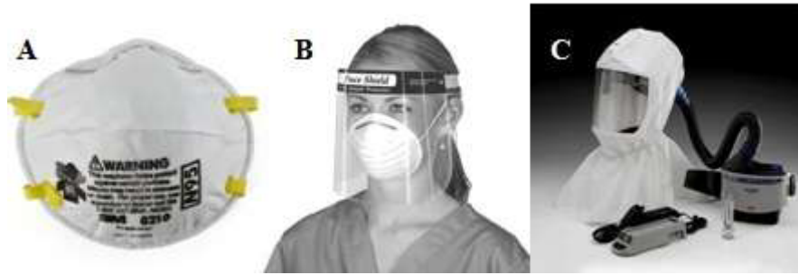
Figure 3. Biosafety level-2 (BSL-2) facility (A), Biosafety level-3 (BSL-3) facility (B) (17)

There are various N95 mask brands from multiple manufacturers available. At 95 percent filtration efficiency, N95 is not resistant to oil. For oily solvents with 95 percent filtering efficiency, R95 is recommended. Higher designations like P100 mean that 99.99 percent of particles are flushed out. Fit checking for the N95 respirator is needed because it is a negative pressure respirator, so it should be perfectly sealed for N-95 users to match the mask fit test. However, fit checking for PAPR is not needed because the atmosphere of the breathing zone is under positive pressure and so a tight seal is not needed for proper operation, a PAPR can be used for users with beards (2) . After facing each patient, the instructions recommended the disposal of N95 respirators (23) .