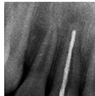
Figure (3): Estimation of working length by digital radiograph .