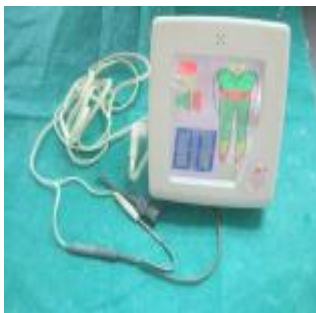
Figure (1): Apex locator device used in the research