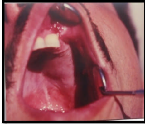
Figure 2-5: Recurrence occur after two months