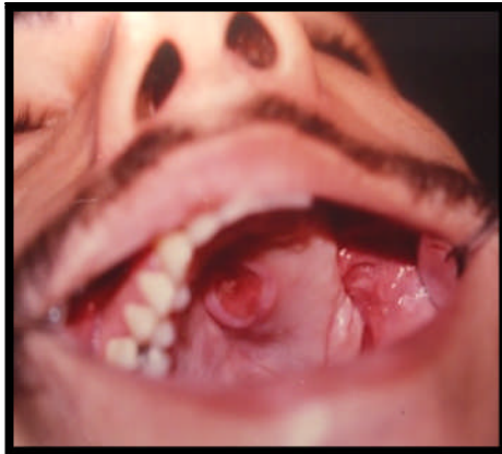
Figure 2-6: The same patient after radical removal of the tumor