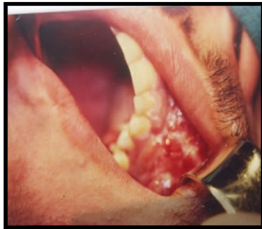
Figure 2-3:Excesion of the tumor with primary closure