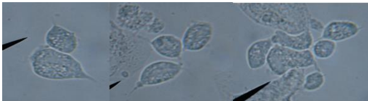
Figure (2) : Trichomonas vaginalis in vaginal discharge and culture