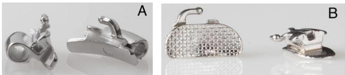
Figure 1: Types of molar tubes based on the mode of attachment. (A) weldable molar tubes (B) bondable molar tubes (3) .

A molar tube is a terminal attachment in the shape of a metal tube bonded on the buccal surface of molars through which the archwire slides as the teeth move (1) . They can be categorized based on the mode of attachment as weldable (welded onto bands) and bondable (bonded to the tooth surface) (Figure 1), based on the lumen shape as round, oval, and rectangular (Figure 2), based on the number of tubes as single, double, and triple (Figure 3), and based on the technique/prescription as Begg tube, Edgewise tube (0° tip and torque values), and pre-adjusted edgewise (with prescribed in-out, tip, and torque values) (2) :