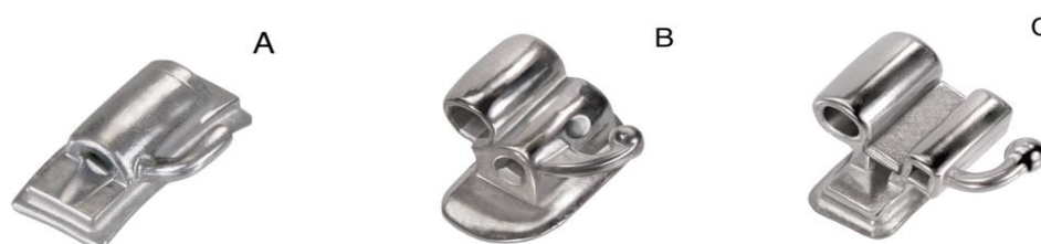
Figure 3: Types of molar tubes based on the number of tubes. (A) Single (B) Double (C) Triple (4) .