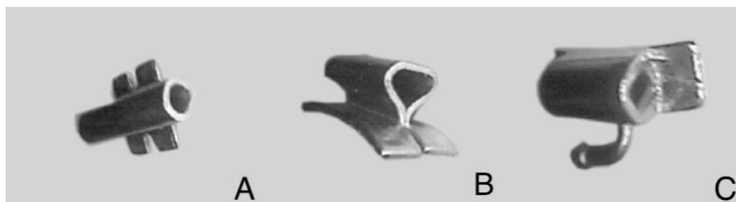
Figure 2: Types of molar tubes based on lumen shape. (A) round (B) oval (C) rectangular (2) .