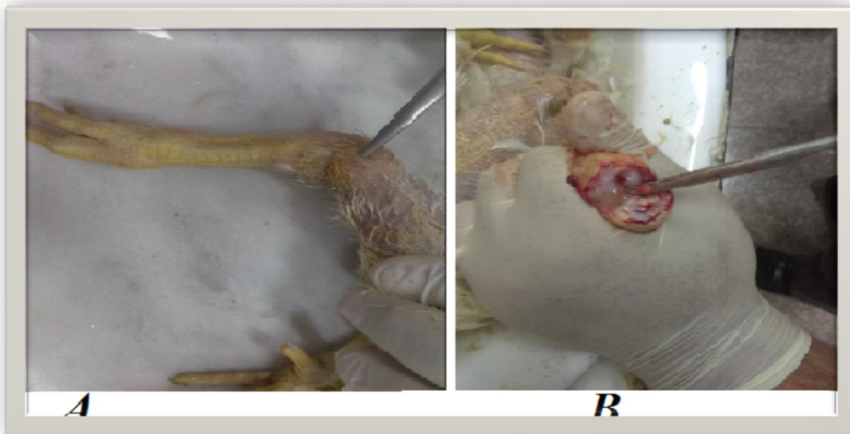
(Figure 1) A: broiler, 18 days old. Note enlargement of ankle joint in the proximal end of femur B: proximal femoral degenerative changes with pus discharge.

there's more than one expectation point about the causes of swelling of ankle joint may be the retention of fluid in leg tissues which is known as peripheral edema. It can be caused by a problem with the circulatory system, the lymphatic system or the kidneys due to fluid buildup after sitting or standing for a long time (11).