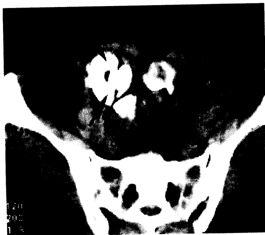
Figure (2) CT Section