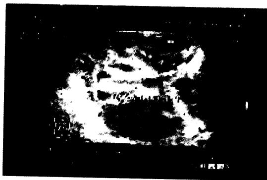
condition explaining the patient's pathology. Figure (1) Sonographic Picture

The diagnosis of idiopathic sclerosing encapsulating peritonitis (abdominal cocoon) was established by intraoperative findings and by ruling out any other..