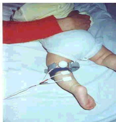
Figure 1: Sites of electrodes during H-reflex recording

The stimuli were constant current, square wave electric shocks of a negative polarity and 0.1 msec.