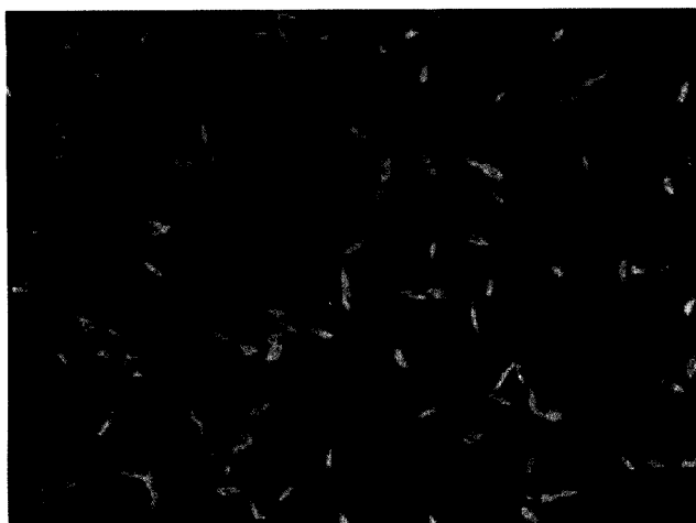
Figure 1: Immunofluorescence of L. donovani promastigotes by IFAT (dark green staining identified positively labeled promastigotes. (magnification power-40X).