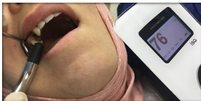
Figure 2: Implant stability measurement using Osstell® ISQ.

All the procedures were performed under local anesthesia lidocaine hydrochloride 2% with epinephrine (1:80,000). A mucoperiosteal flap was reflected and the implant site preparation proceeded using osteotomy drills of increasing diameter corresponding to the implant dimensions with an implant micromotor (Dental surgery micromotor iCT, Dentium, Korea) rotating at a speed of 800 rpm with copious saline irrigation. The implants (Superline, Dentium, Seoul, Korea) were installed into the osteotomy site using the motorized method with the engine set at 50 rpm and 35 Ncm torque, so that the implant platform is 0.5-1 mm below the bone level. When the implant could not be inserted to the requisite depth by the motorized method, a hand ratchet was used and the IT was recorded as > 35 Ncm. Accordingly, in this study, implants were categorized into two groups regarding the IT; one group with 35 Ncm insertion torque and the other > 35 Ncm. Immediately after insertion of DI, the primary stability was measured using Osstell®ISQ (Osstell®, Gothenburg, Sweden). Two repeated measurements were obtained for each implant along the buccolingual and mesiodistal axis and the mean of these two readings was taken ( Fig. 2 ).