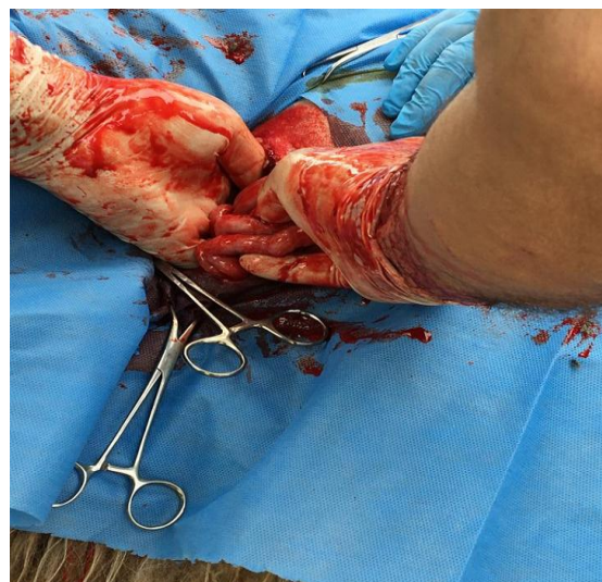
Fig. (3) Exteriorization of female genital system outside the body