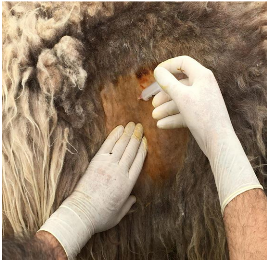
Fig. (1) local infiltration of lidocaine in site of operation (left flank region)

(depending on uptake) but will be around one hour without epinephrine and two hours with epinephrine. The flank laparotomy approach is the most widely used among small ruminant surgeons for accessing abdominal and pelvic organs. Prolonged lateral recumbency in goats under anesthesia is associated with decrease in rumen stasis thereby predisposing the animal to bloat and toxemic lactic acidosis. It is done without intra and post- surgical complication. This technique is simple, easily done, save time and cost as well as reduce the surgical trauma with few suture materials(11). The study was the first of its kind all over the world in exteriorization of genital organs in standing position in ewes.