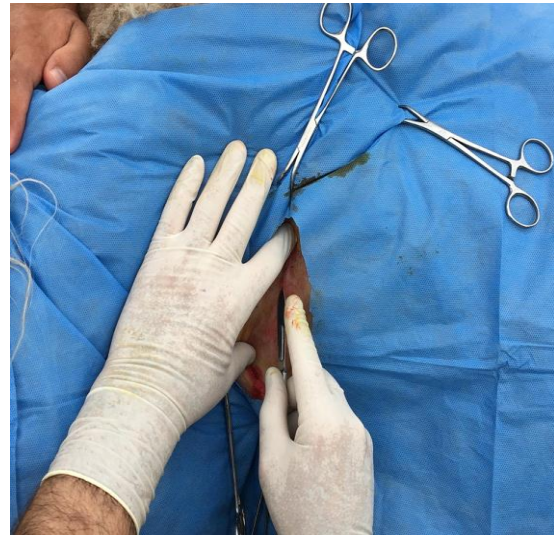
Fig. (2) Make an incision in the flank region under disinfected condition