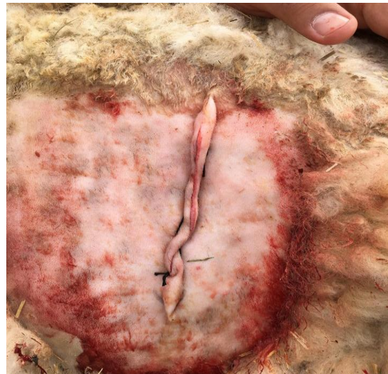
Fig. (7) Closed the skin using horizontal suture pattern