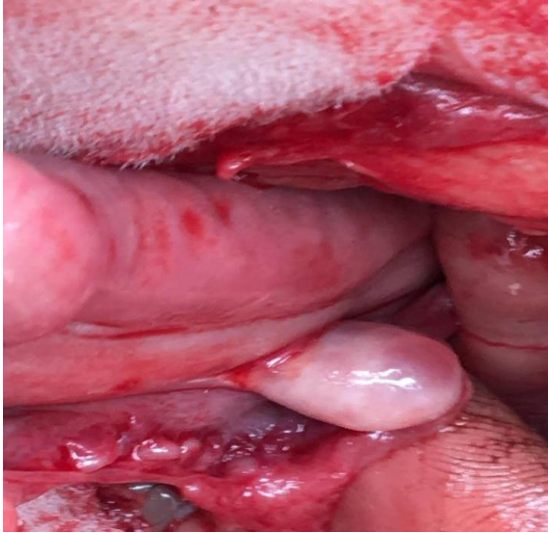
Fig. (4) Ovary have different size follicles