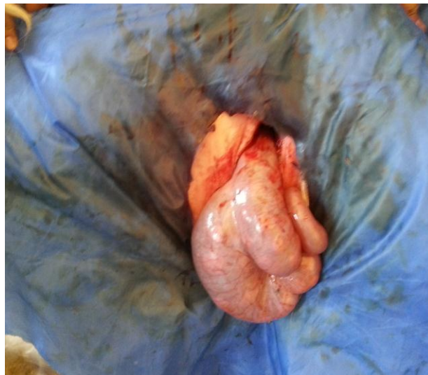
Fig. (8) Showed early pregnancy