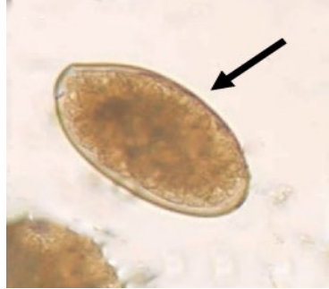
Figure (3): Eggs of Trematodes. The microscope image displays a Fasciola hepatica egg under 40X magnification.

In addition, results of the present study showed that the infestation rate of GIP was significantly different ( P < 0.05 ) between months; that was significantly higher in