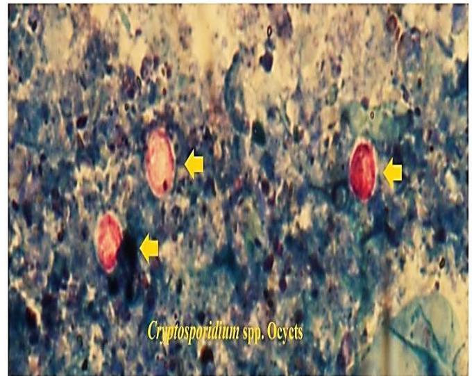
Figure 1. Cryptosporidium oocysts in feces of pigeons diagnosed using modified-Ziehl-Neelson (MZN) staining method, magnification 100x

samples showed indications for Cryptosporidium , 6 males and 8 females, which accounted for only 14% of the total examined feces.