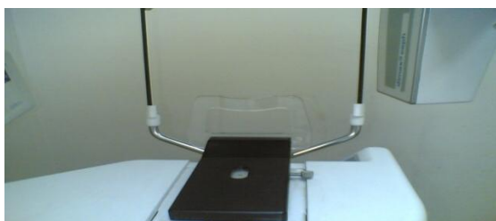
Figure (2): A) Chin support in place for use in case of edentulous subject