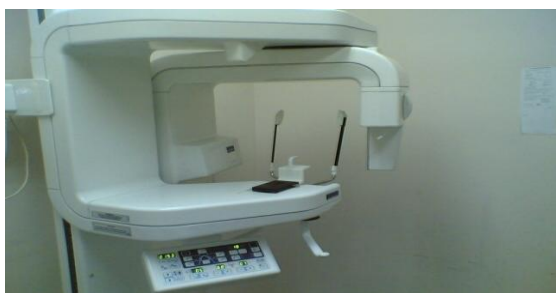
Figure (1): Dimax 3 digital Planmeca X-ray machine (panoramic part)