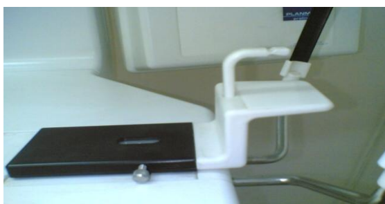
B) Chin rest with the bite piece in place for use in case of dentate subject