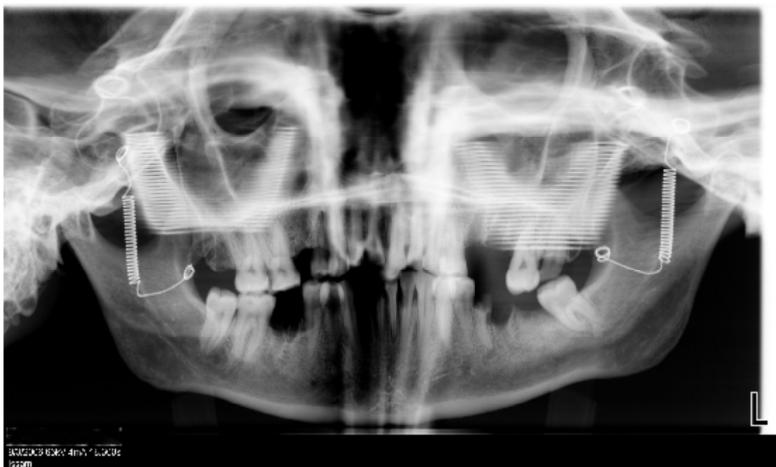
Figure 4:- digital panoramic radiograph where the image obtained with the tube current level (mA) reduced by 50%.