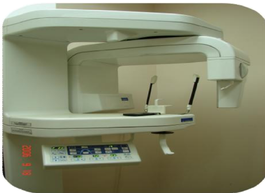
Figure 1 :- dimax 3 digital planmeca x-ray machine .