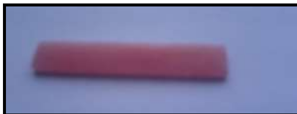
Figure (1): acrylic sample

Curing was carried out by placing the clamped flask in a water bath and processed by heating at 74 °C for about (1.30) hr, the temperature was than increased to 100 °C for (30) min. 10 , and then the flask was allowed to cool slowly at room temperature for (30) min. followed by complete cooling of the flask with tap water for (15) min. before deflasking. While in case of cold cure acrylic resin, flasks containing the acrylic resin dough were left in a bench press for (2hrs) at 23 °C± 5 °C 11 . The acrylic patterns were then removed from the mold. (as shown in figure ( 1 )