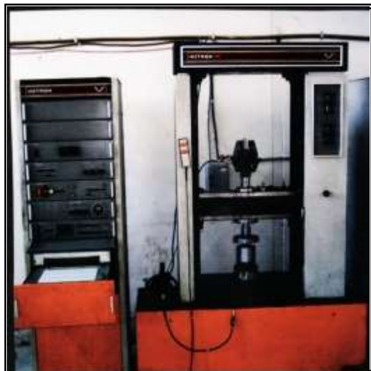
Figure (2): Instron testing machine