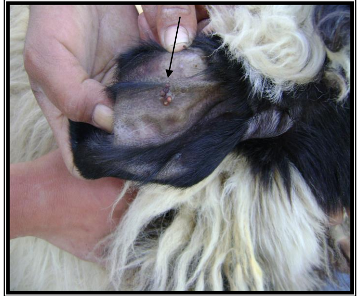
Treatment with anise oil(2)