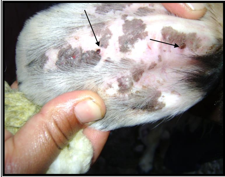
Treatment with Ivermectin (1)

Result of application after (24 hours) showed the different percentage of acaricidal effect (Table 1) (plate 2).