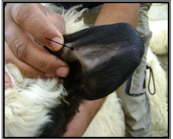
Treatment with Salvia oil (4)