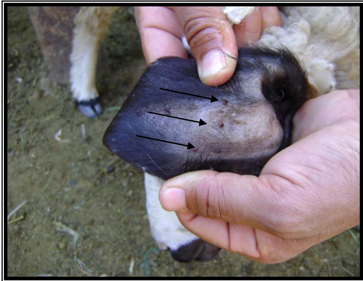
Treatment with Thyme oil(3)