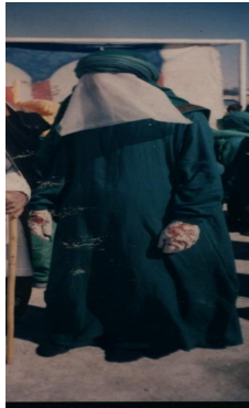
شكل رقم (١٢)