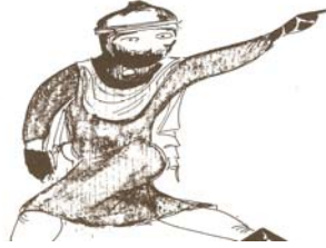
شکل رقم (۲)