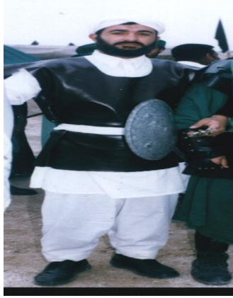
شكل رقم (٢١)