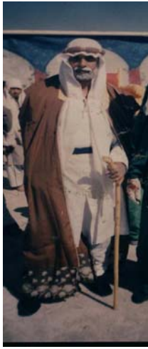
شكل رقم (١٩)