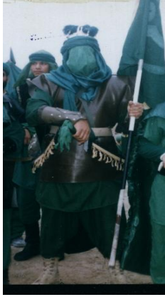
شكل رقم (١٨)