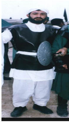
شكل رقم (١٤)