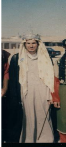
شکل رقم (۱۶)