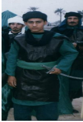
شكل رقم (١٣)