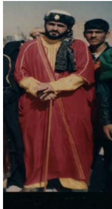
شكل رقم (١٥)