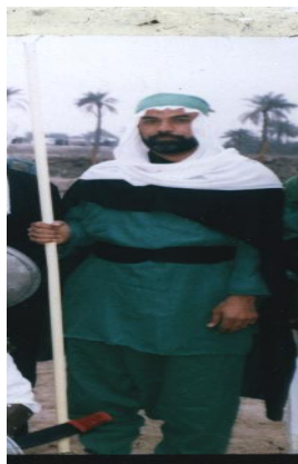
شكل رقم (٢٣)