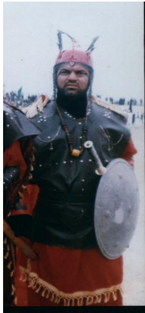
شکل رقم (۱۷)