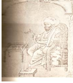
شکل رقم (۷)