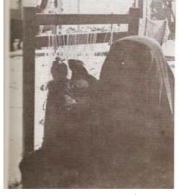
شكل رقم (٤)