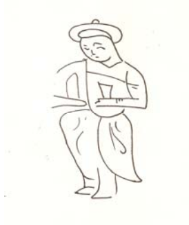
شکل رقم (۹)