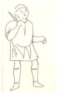
شكل رقم (٦)