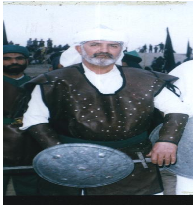
شكل رقم (٢٢)