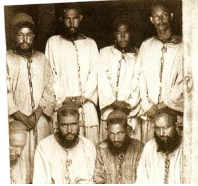
شکل رقم (۳)