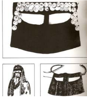
شكل رقم (٥)