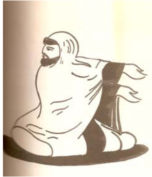
شکل رقم (۸)