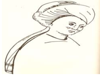
شکل رقم (۱)