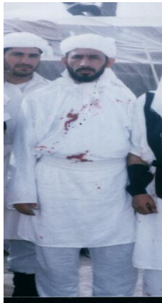
شكل رقم (٢٠)