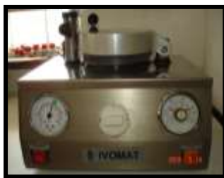
Figure (1): Ivomat curing device.