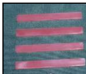
Figure (2): Tested specimens for transverse strength