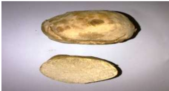
Figure 2. An ascocarp of Tirmania pinoyi and a cross section of it.