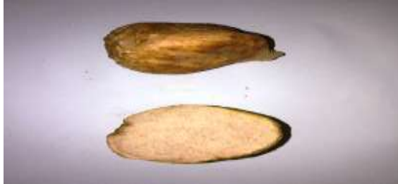
Figure 1. An ascocarp of Terfezia claveryi and a cross section of it.

According to Alsheikh (21,22) , the ascocarp of two studied species have lobed shape and diameters of 4 to 10 cm. The studied species T.claveryi and T.pinoyi present different characteristics. T.claveryi has a brownish-yellow peridium and a gleba with fleshy appearance and yellow-pinkish color. Asci are subglobose and contain 8 globose spores ornamented with warts. T.pinoyi has a white peridium, and a gleba with fleshy appearance and white color. Asci are pear-shaped and contain 8 smooth globose spores which have double outer layer.