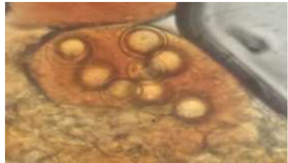
Figure 4. An ascus of Tirmania pinoyi which contains 8 smooth globose spores (colored with alcoholic iodine, magnification \times 40 ).

The results of detection about phytochemical components for dried T.claveryi and T.pinoyi indicate the probability of containing alkaloids, coumarins, flavonoids, phenols, and steroid and triterpenoid glycosides. T.claveryi also may contain little of saponins (Table 1). This is the first time that determination of chemical composition to truffle was published.