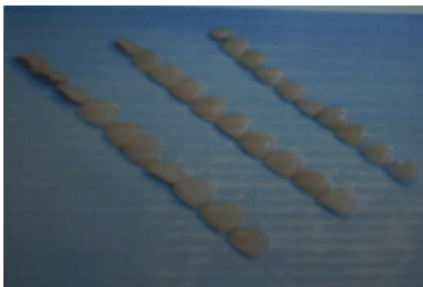
30 samples after ceramic condensation & glazing

Also the final thickness of the metal covered with ceramic can be determined by using metal gauge that was each labial surface of each sample checked on, in which the whole labial surface had the uniform thickness .